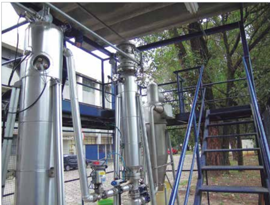
Figure 1. Steam explosion equipment

FAPESP Process 2007/51656-2 | Term: Oct 2008 to Jul 2012 | PITE – Business partner: Oxiteno S/A