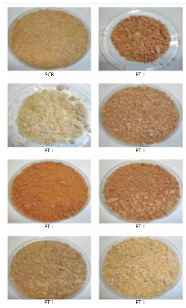
Figure 1. Color of the lignocellulose enriched- fractions obtained by using of modified pre- treatments applied to sugarcane as described by Miranda et al. (2015). SCB is a milled sample of sugarcane bagasse in natura

FAPESP Process 2013/15082-2 | Term: May 2014 to Apr 2016