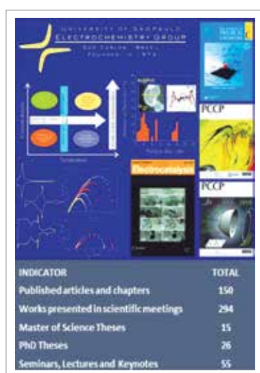
Figure 1. Highlights of the scientific production between 2010 and 2013. The cover pages appeared in the following periodics are included: J. Phys. Chem. C 114, 2010, issue 43; Phys. Chem. Chem. Phys. 13, 2011, issue 2; Idem 14, 2012, issue 23; and Electrocatalysis 4, 2013, issue 2

Co-PIs: Ernesto Rafael Gonzalez, Fabio H. Barros de Lima, Germano Tremiliosi Filho, Hamilton B. Varela de Albuquerque