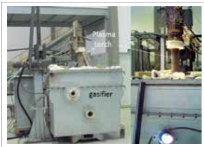
Figure 2. Plasma gasifier of ITA

The thermochemical assessment of plasma gasification efficiency for the case of Brazilian industrial scale coal and coal-based water slurries with using of steam and air as gasifying agents was carried out. The data calculated show that for reforming this coal feedstock (with quite high ash content of 28 %) to syngas with yield of near 100% the energy consumption level of 10-12 MJ/(kg of syngas) is sufficient on the thermodynamic results at the using of regimes with ratio of mass flow rates of feedstock to gasifying agent G_C / G_{ST} = 4.0 for coal. The calculated level of calorific value of syngas, that is possible to produce from this kind of low-grade feedstock at the optimal thermochemical conditions of plasma gasification is quite high for special fuel using of syngas in the industrial combustion and