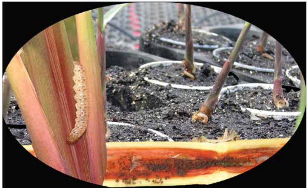
Figure 1. Sugarcane plants exposed to Diatraea saccharalis attack and damage produced by the caterpillars after insect wounding and colonization by opportunistic fungi

Plant responses to insect damage have been investigated and these studies have resulted in new methods to enhance host resistance to insect pests, including the use of insecticidal proteins that can be expressed in selected crops by genetic engineering. Integration of the knowledge of how plants react to insect damage with the techniques of molecular biology should be able to increase even more the methods available for the control of insect pests. Understanding how insects cope with plant defenses also has proved instrumental into designing new strategies for crop protection. The sugarcane transcriptome project (SUCEST) has allowed the identification of several genes involved in the plant response to insect damage. There are numerous classes of naturally occurring phytochemicals that are thought to confer resistance to plants against herbivorous insects. These classes include lectins, waxes, phenolics, sugars, alpha-amylase inhibitors and proteinase inhibitors. Analysis of sugarcane-expressed genes involved in secondary metabolism suggests that most of the expressed