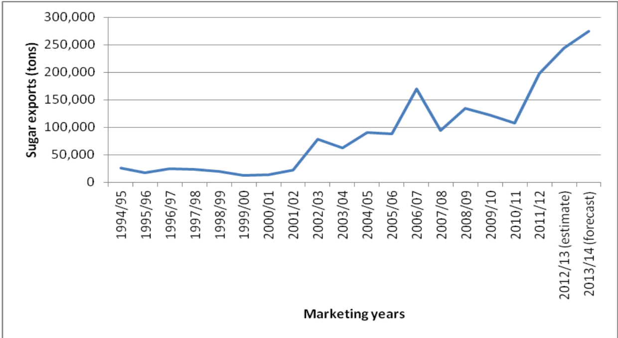
Figure 4: Mozambique’s sugar exports from 1994

Mozambique’s sugar exports are expected to reach 275,000 tons in the 2013/14 MY, on increase of local sugar production. Mozambique exported a record of 243,583 tons of sugar at value of $126.2 million in the 2012/13 MY (see also Figure 4). This represent an increase of more than 100 percent from the 107,989 tons exported in the 2010/11 MY, due to an almost 50 percent increase in sugar production. The main export market for Mozambique’s sugar is the European Union (EU), under the Economic Partnership Agreements (EPA) that was introduced in 2009. EPA allows for preferential access to the EU market for Mozambique sugar. The United States also allows preferential access for Mozambique sugar under its Tariff Rate Quota. However, due to higher income realization, Mozambique exported only to the EU in the 2011/12 MY and 2012/13 MY. Post expects Mozambique will again only service the EU market in the 2013/14 MY.