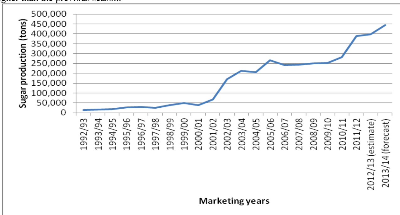
Figure 2: The production of sugar in Mozambique since 1992

Since 2000, sugar production in Mozambique showed a sustain increase as economic and political stability attracted new investments in the industry (see Figure 2). Post forecasts that this trend will continue in the 2013/14 MY and that sugar production in Mozambique will increase by almost 12 percent to a record 445,500 MT (460,575 MTRV), due to an increase in sugarcane production. For the 2012/13 season, Mozambique's sugar production is estimated at 396,719 MT (410,604 MTRV), two percent higher than the previous season.